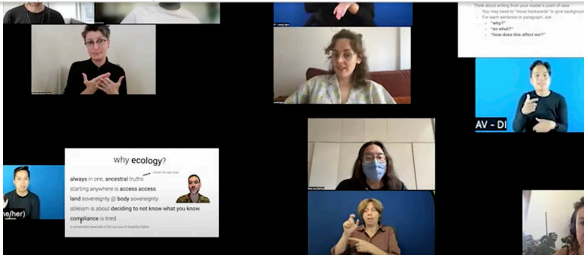
Image description: There is a collage of screenshots from 4 events on Zoom. There's a lot of people frozen mid-action: speakers talking, ASL interpreters signing, and a few slides from screenshares.