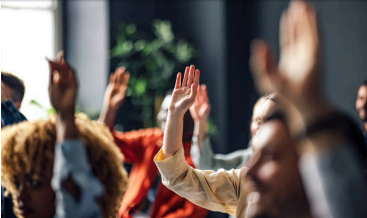
Image description: A group of people wearing long sleeves raises their hands. The hands in the foreground and background are blurred, and the middle hand of the group is in focus.