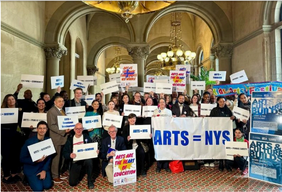
Arts Rally hosted by NY4CA and Senator Serrano on March 19, 2024