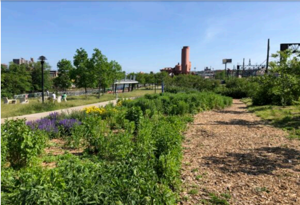
Food Policy Community Spotlight Series, Hunter College New York City Food Policy Center