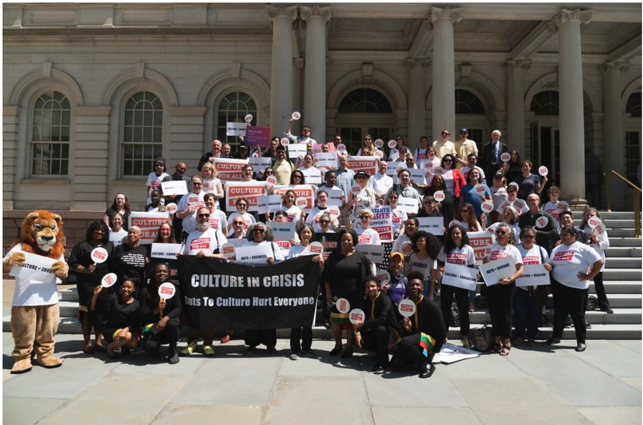
Rally at NYC City Hall on Tuesday, May 21, 2024.

On the same day, the NYC Council called for full restorations of the mayor's cuts to the city's cultural institutions and three public library systems. The Council identified the need to restore $75.6 million in its Preliminary Budget Response, but the Mayor's Executive Budget only included $15 million.