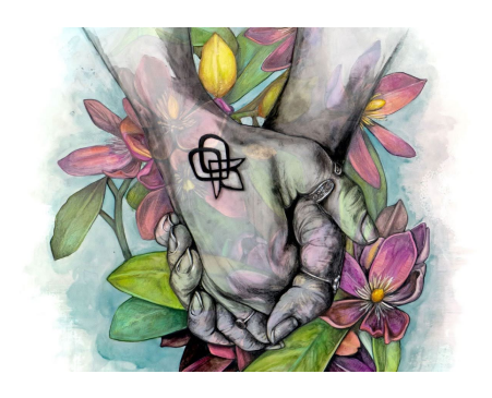
How Artists Can Foster Collective Community Healing