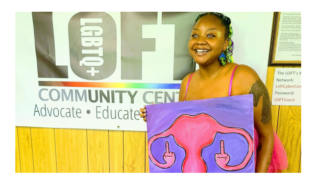
<u>Artists Empower & Change</u> <u>Narratives About LGBTQ+ People</u>