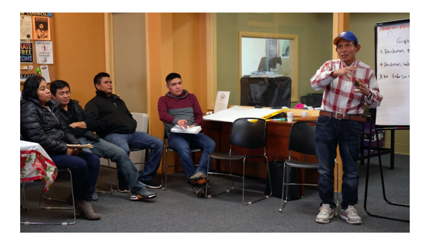
How NY Artists Are Using Their Craft to Support Immigrants